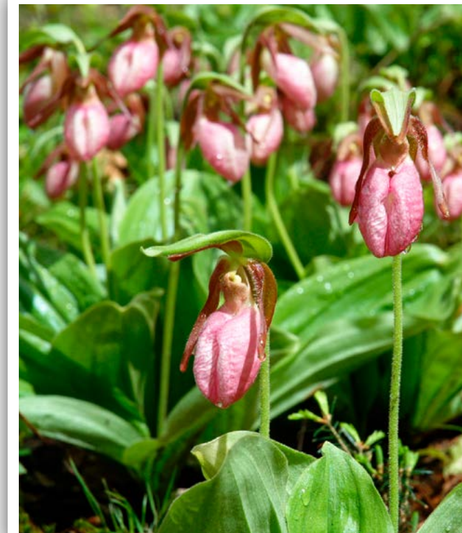
ABOVE – Lady Slippers in Wilmot.

FESTIVAL OF TREES – At Whipple Hall, New London.