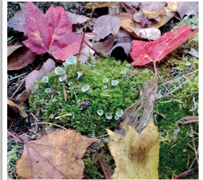
ABOVE – Autumn forest scene

Thank you for reading the INTERTOWN RECORD and supporting our advertisers, who support the local news!