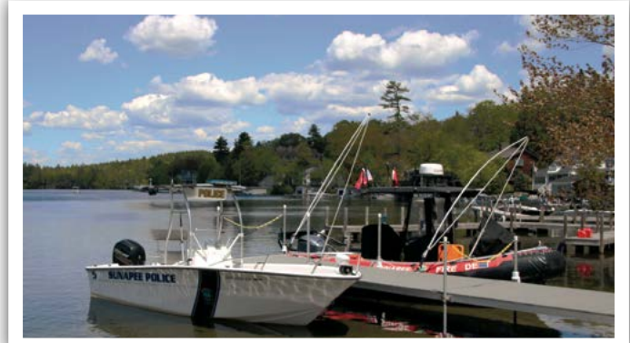
SUNAPEE HARBOR – At left are the police and fire dept. boats for Sunapee Harbor. Above is the gazebo.

There are also plans to build a new fun and games area in the backyard along with revamping the riv-