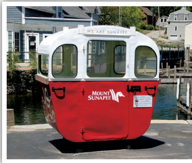
ABOVE – Gondola in Sunapee Harbor